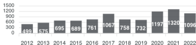
Total animals by drop

Report: Genetic Trends Analysis: TERMINAL Analysis date: 15/07/2022 Flock code: 230099 Flock name: ASHMORE